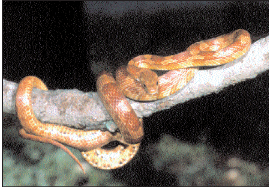
Red rat snake.

The lower Keys populations of red rat snakes live in pine woods and mangrove forests (Weaver 1992). They are primarily nocturnal, hide under rocks and logs, and will burrow into loose sand. The red rat snake is being threatened by the increasing development activities that are occurring throughout the Florida Keys. Although the red rat snake population in the Keys was documented as declining before the recent surge of development, the numbers appear to be stable and locally abundant. The lower Keys population of red rat snake has been listed as a species of special concern by the State. Although the numbers appear to be stable, the paucity of field work makes estimates of population sizes questionable. Conservation actions should continue to include the preservation of suitable habitat, including pine rocklands.