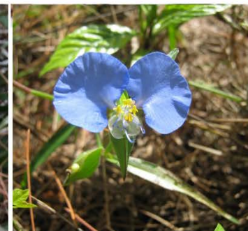
Whitemouth dayflower ( Commelina erecta)