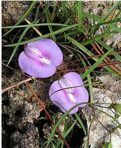
Spurred butterfly pea ( Centrosema virginianum ) KW