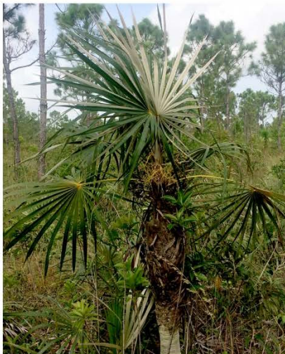
Silver palm ( Coccothrinax argentata ) LC