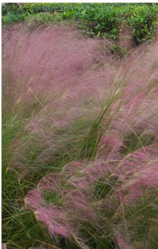
Muhlygrass ( Muhlenbergia capillaris ) JP