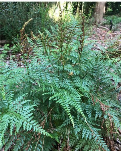
Pineland fern ( Anemia adiantifolia ) JP