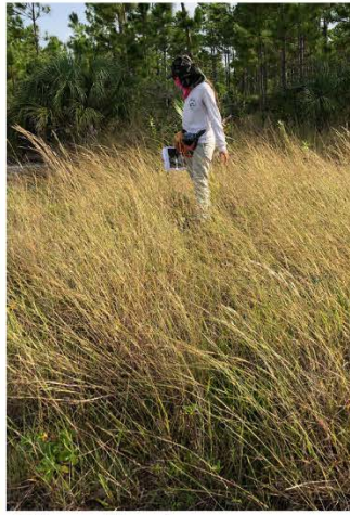
Crimson bluestem ( Schizachyrium sanguineum ) JP