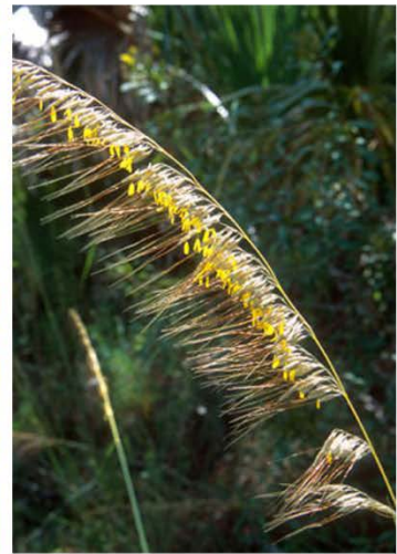
Lopsided Indian grass ( Sorghastrum secundum ) JP