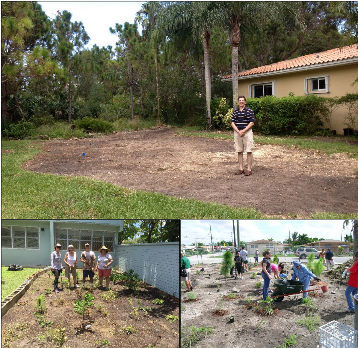
Figure 3. Site preparation. Clearing the area of turfgrasses and other unwanted plants prior to installation is critical to the success of a pine rockland planting.

As a final step in site preparation, consider removing any soil that may have been added to the site. This step may not always be realistic, and it is not necessary to grow most pine rockland plants. However, it should be implemented when and where practical. This is because most South Florida yards have amended soil and an excess of nutrients from years of lawn fertilization. Removing this unnatural soil gets rid of weed seeds, restores soils 1 closer to their original composition, and may make it easier to grow some of the more finicky pine rockland endemics. Depending on the yard, this may mean removing several inches of soil. This can be accomplished with shovels for a small area, or even by renting (or borrowing) a skid steer with a bucket (e.g., Bobcat) or mini bulldozer for larger areas.