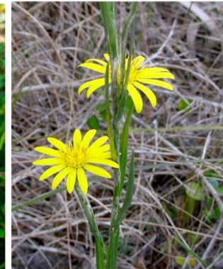
Narrowleaf silkgrass ( Pityopsis graminifolia ) JP