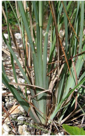
Common fingergrass ( Eustachys petraea ) JP