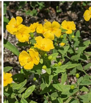
Pitted stripeseed ( Piriqueta cistoides ssp. caroliniana ) LC