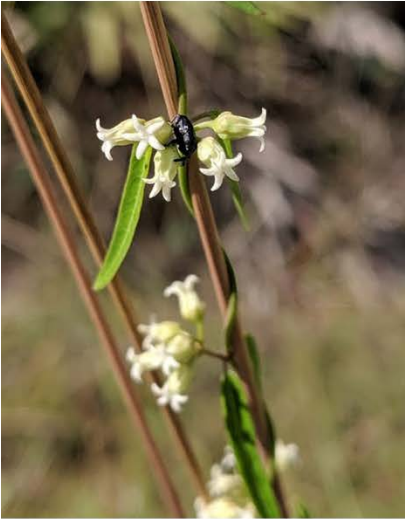
Blodgett's swallowwort ( Metastelma blodgettii ) LC