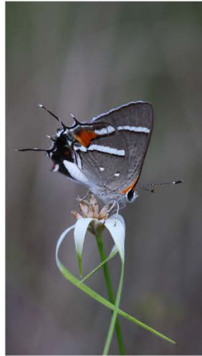
Florida whitetop ( Rhynchospora flordensis ) DS