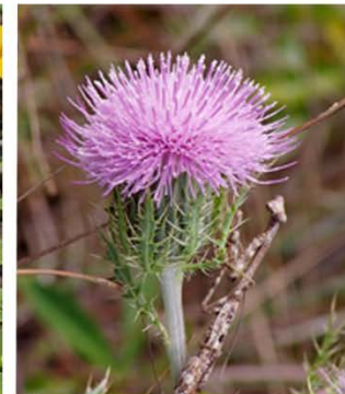
Purple thistle ( Cirsium horridulum ) GG