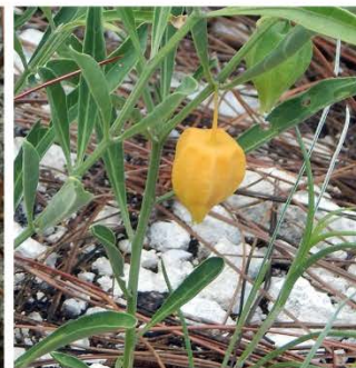
Walter's ground cherry ( Physalis walteri ) LC