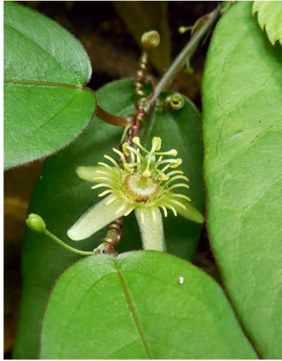
Corkystem passionflower ( Passiflora suberosa ) JP