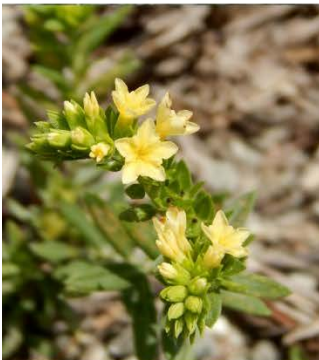
Pineland heliotrope ( Heliotropium polyphyllum ) LC