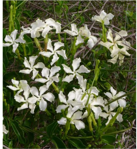
Devil's potato ( Echites umbellatus ) JP