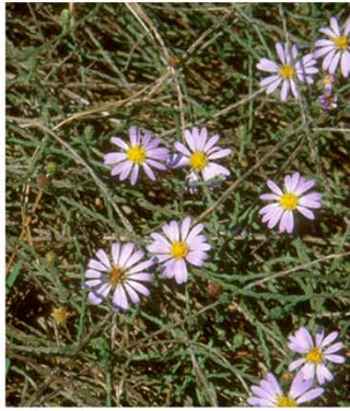
Clasping aster ( Symphyotrichum adnatum ) RH