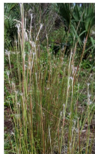
Wire bluestem ( Schizachyrium gracile ) LC