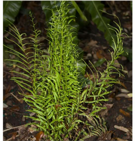
Bahama ladder brake ( Pteris bahamensis ) KS