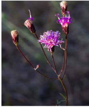
Florida ironweed ( Vernonia blodgettii ) JJ