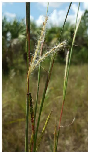
Splitbeard bluestem ( Andropogon ternarius ) JL