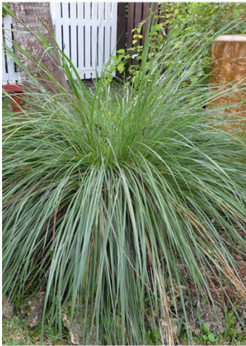
Florida gamagrass ( Tripsacum floridanum ) JP