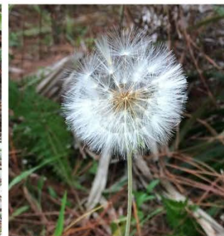
White sunbonnets ( Chaptalia albicans ) LC