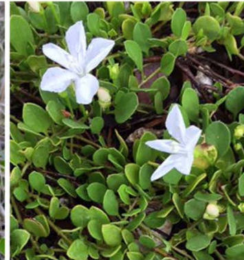
Pineland clustervine ( Jacquemontia curtissii ) AS