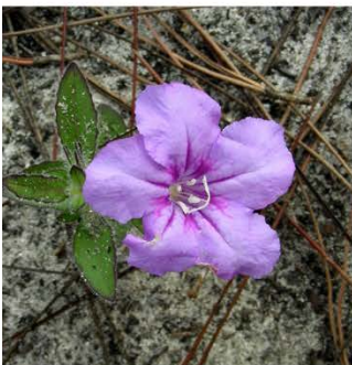
Pineland petunia ( Ruellia succulenta ) JP