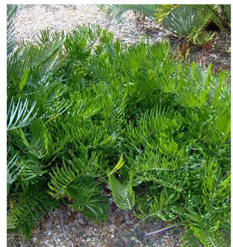
Coontie ( Zamia integrifolia)