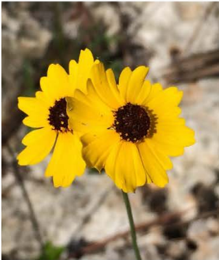
Leavenworth's tickseed ( Coreopsis leavenworthii ) LC