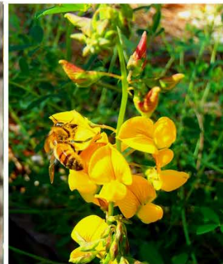
Low rattlebox ( Crotalaria pumila ) JS