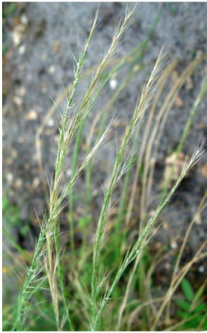
Arrowfeather threeawn ( Aristida purpurascens ) SW