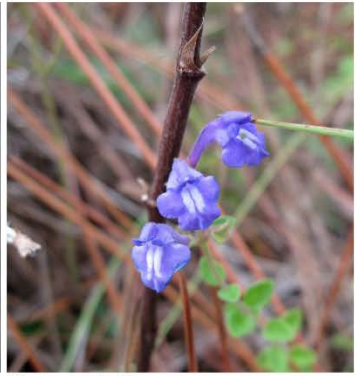
Havana skullcap ( Scutellaria havanensis ) JP