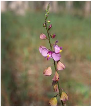
Candyweed ( Polygala violacea ) RH