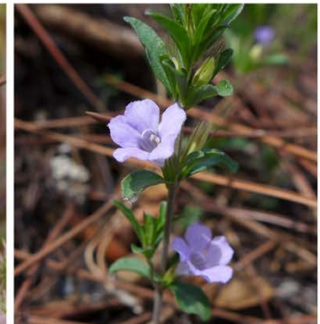
Rockland twinflower ( Dyschoriste angusta ) JP