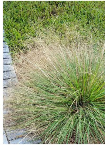
Elliott's lovegrass ( Eragrostis elliottii ) VR