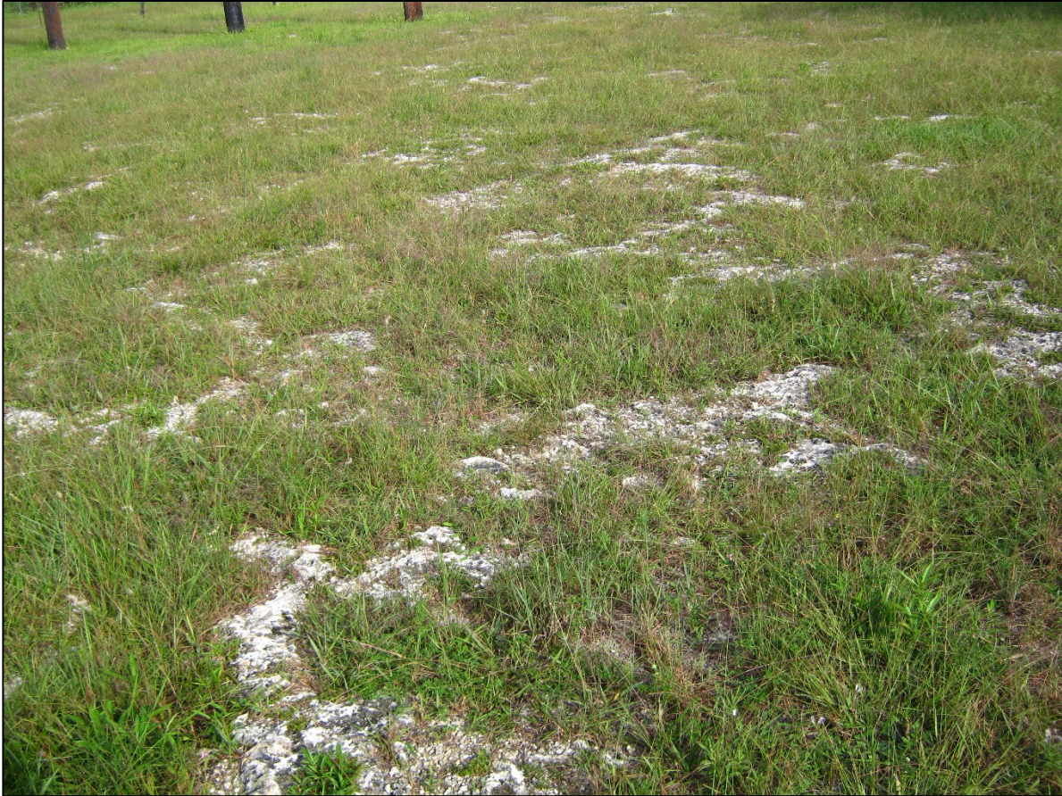
Figure 2. Site selection. The area shown here would be optimal for a pine rockland planting. The site is sunny and not immediately adjacent to structures that could be damaged by fire. Natural limestone topography that appears to have been only lightly scraped is visible at the surface. Many of the plants present are native to pine rocklands, including mouse's pineapple ( Morinda royoc ), candyweed ( Polygala violacea ), and Elliott's lovegrass ( Eragrostis elliottii ).