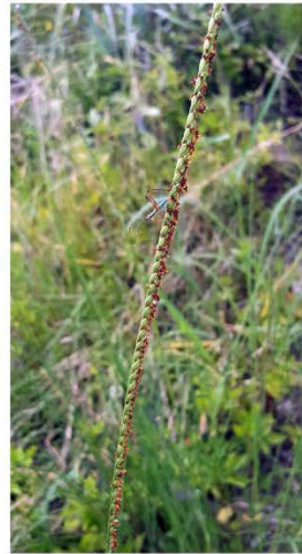
Gulfdune paspalum ( Paspalum monostachyum ) JP