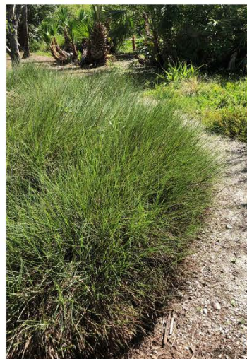
Rhizomatous bluestem ( Schizachyrium rhizomatum ) JP