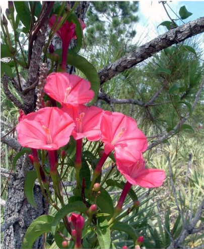
Man-in-the-ground ( Ipomoea microdactyla ) JP