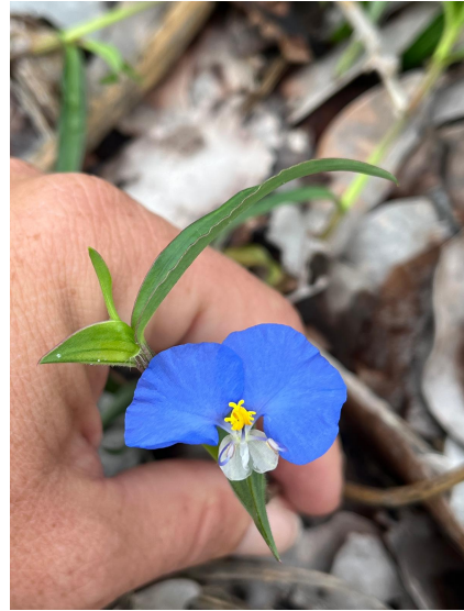
Whitemouth dayflower ( Commelina erecta )

IRC has an E-Trade account. Please contact us about giving gifts of stock.