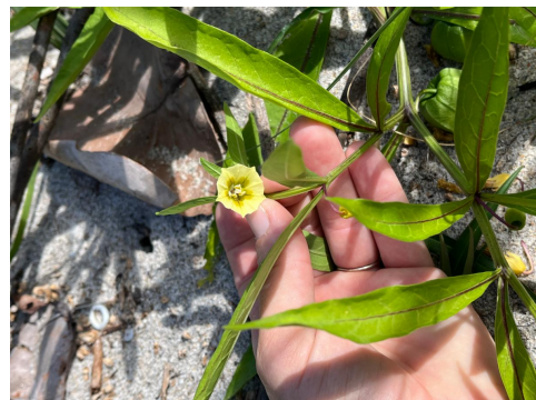
Physalis walteri (Walter's groundcherry)

IRC has an E-Trade account. Please contact us about giving gifts of stock.