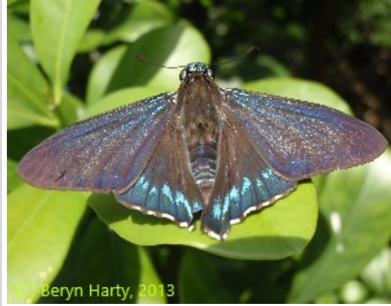
Photo of Mangrove Skipper

South Florida focused on native plants, water conservation, and non-toxic fertilization practices. Amelia's Smarty Plants is a garden center that offers native plants, pots, and garden