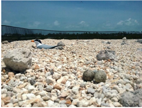
Successful nesting and laying by least terns.