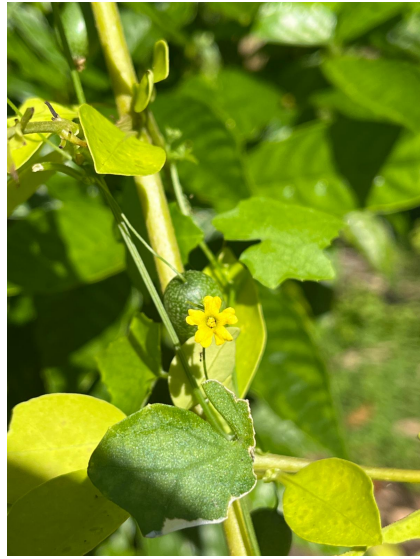
Creeping-cucumber ( Melothria pendula )