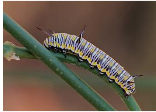
Soldier Caterpillar. Soldier ( Danaus eresimus) on Whitevine ( Funastrum clausum).

IRC has an E-Trade account. Please contact us about giving gifts of stock.