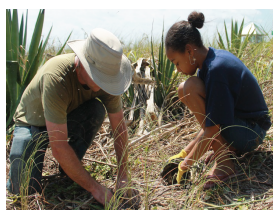
Planting of Native Species