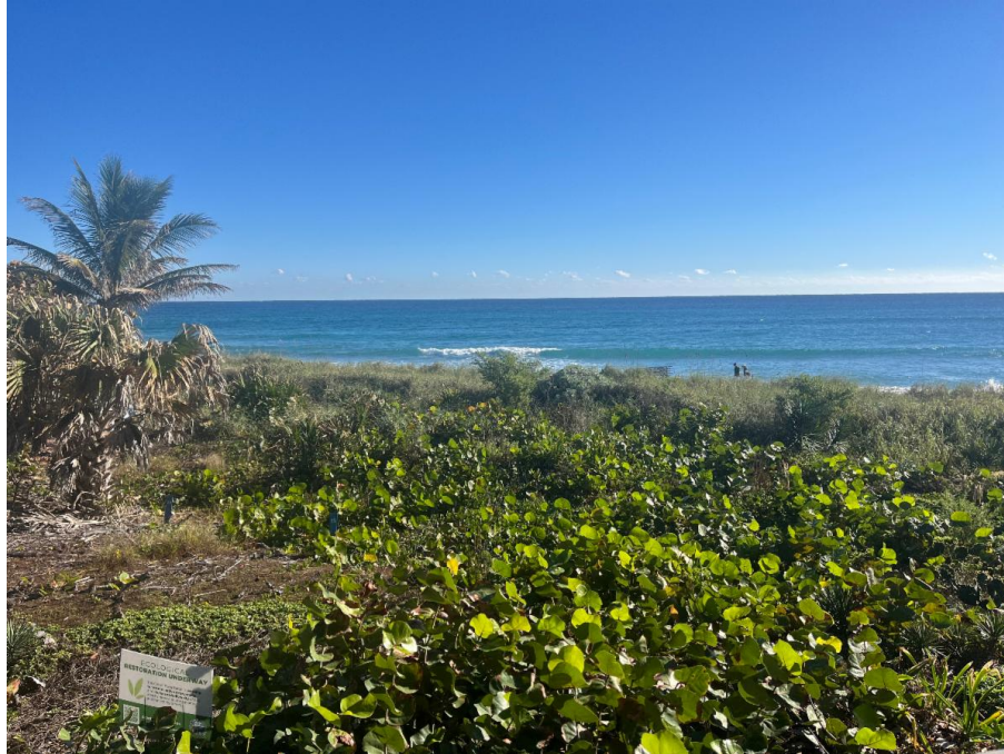
Ongoing restoration at Red Reef Park, Boca Raton, FL

As 2024 comes to a close, we at IRC would like to extend our heartfelt gratitude to all our supporters, volunteers, and partners who have stood by us through the years. Your unwavering dedication has been the cornerstone of our success, and together, we are making a real difference for South Florida's native ecosystems.