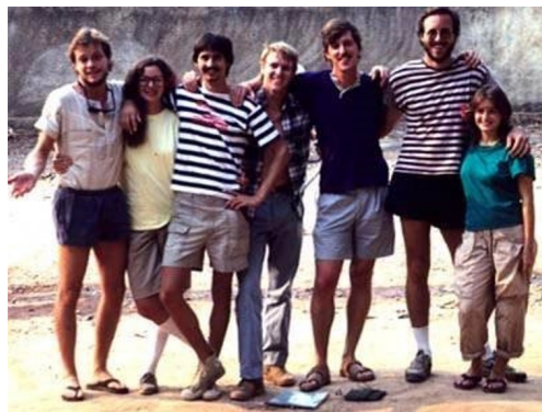
IRC Founders in the Amazon, 1985