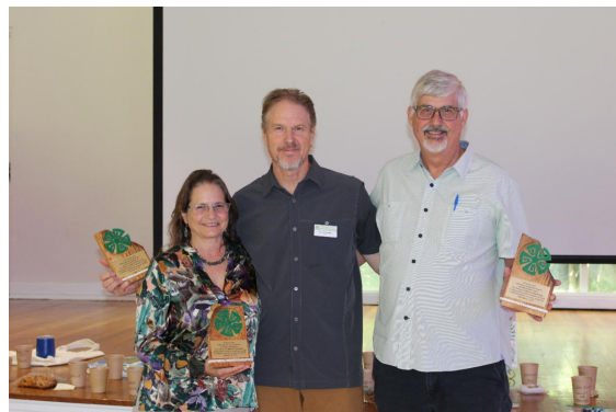
IRC Founders at 40th Anniversary Celebration